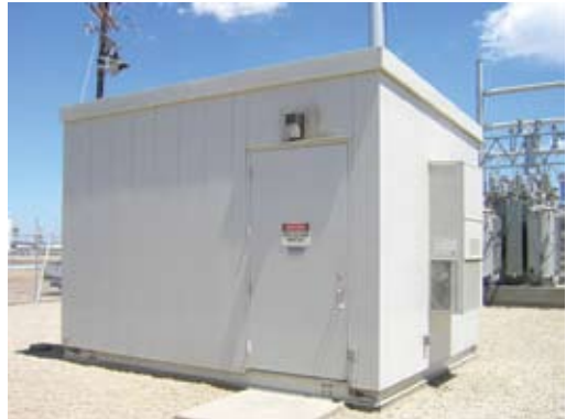
ETHANOL PLANT SUBSTATION PROJECT IN STOCKTON, CA

Lectrus can also combine operator and equipment center functions into one unit, either on a single level, or in a multi-level center that combines an operator pulpit with a lower level equipment center.