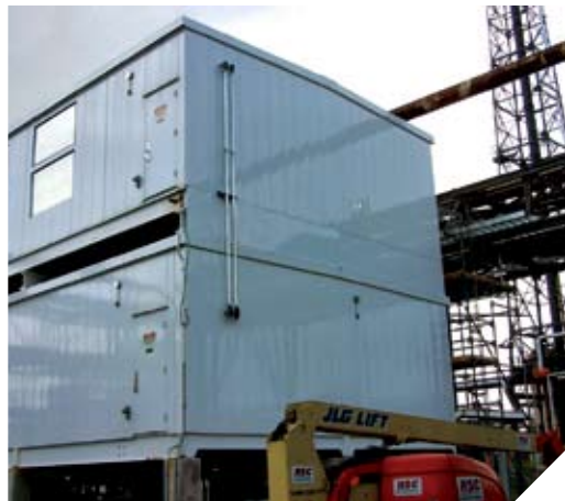
POLYCARBONATE-URETHANE/ALKYLATION PROCESS EQUIPMENT CENTER PROJECT IN WHITING, IN